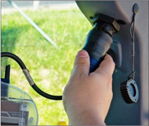
Plugging into the diagnostics port ...

So don’t get caught up in the hype generated by the Flash Tuners - why risk your equipment at the end of the day is saving a few hundred $$ really worth the safety of your engine.